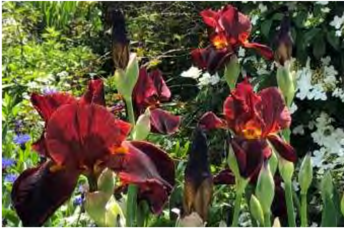
Newsletter of the Master Gardeners of Ontario