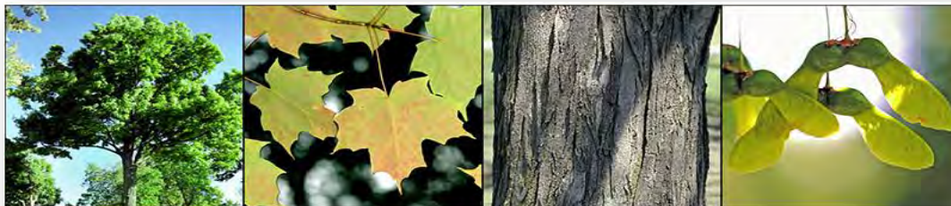
Sugar maple images from the Ontario Tree Atlas

Acer saccharum has the reputation of being finicky and intolerant of pollution but as long as it is planted in rich well drained soils with good sun exposure & adequate moisture, it will do well.