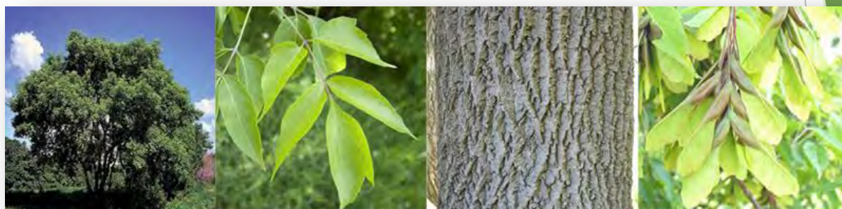
Manitoba maple images from Ontario Tree Atlas

The Manitoba maple is also known as box-elder. Native to the prairies in Canada, it has become naturalized in much of our region and is considered invasive in Ontario. These trees grow to 20 metres tall and are fast growing and short lived (maximum 60 years). As with other invasives, Manitoba maples are adaptable to many types of soil, light, and moisture conditions and happily grow in difficult and disturbed areas. These maples are unusual for their genus in having compound leaves with 3-9 toothed leaflets which turn yellow in fall. The young twigs have a waxy powder on them. In southern Ontario, this tree's weak wood leads to problems with breakage and the requirement for careful pruning to maintain form and to avoid breakage. While it is considered an excellent tree in its native prairies because it tolerates persistently cold temperatures, it is best avoided here.