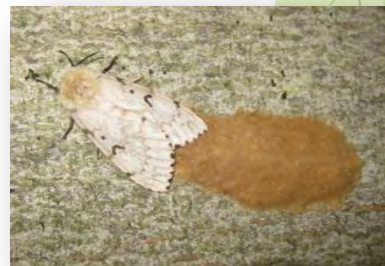
Female gypsy moth laying eggs Brown egg masses can be scraped or vacuumed!