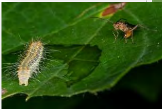
Small parasitic wasp, Meteorus , parasitizing a caterpillar.

Parasitic wasps are incredibly diverse in appearance, ranging in size from as small as a fleck of pepper up to nearly 3" long, and from uniformly dark in colour to brightly coloured and patterned. Most females have a long, sharp "ovipositor" which they use to deposit eggs (singly or in groups), into hosts. Different parasitic wasps have different egg-laying equipment depending on what they are parasitizing. Species that penetrate wood to parasitize the larval insects within it, are penetrating into solid substrates and thus are not only larger but are equipped with a significantly larger "ovipositor".