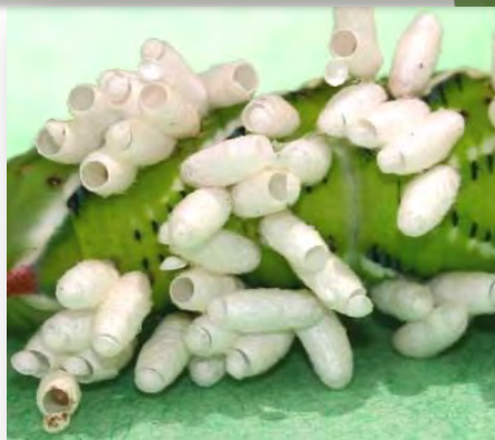
Close-up of pupae showing where wasps have emerged

Parasitic wasps are very difficult to spot in the garden. The eggs are usually inserted within the bodies of host insects, the larvae glimpsed only as a dark shape within the body of a host insect. The pupae may be seen as a whitish/yellowish, rice-like cocoon near parasitized insects and the adults are often quite small.