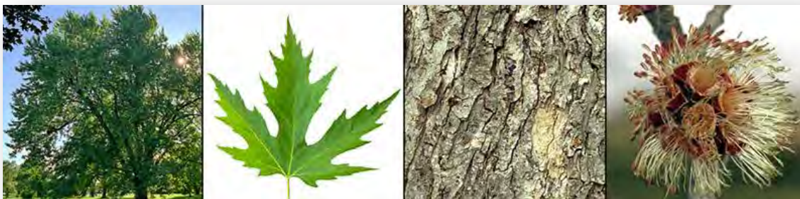
Silver maple images

The silver maple is a large and fast-growing tree, attaining up to 35 metres in height, with a trunk diameter of 100 cm. Its leaves are light green, silvery white below, 15-20 cm with 5 or 7 heavily indented lobes distinguishing it from other maples. In the autumn, leaves turn yellow or brown, not red. These leaves are particularly thin and break down easily when composted. The bark is smooth and grey, becoming darker with age and breaking into distinctive strips that peel at either end giving a shaggy appearance. Another maple which prefers rich moist soil and full sun, it tolerates city streets although care must be taken as the roots spread aggressively and can clog sewer pipes and buckle sidewalks.