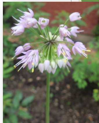
Native Nodding Wild Onion is a great native plant replacement for Stella d'oro day lilies.