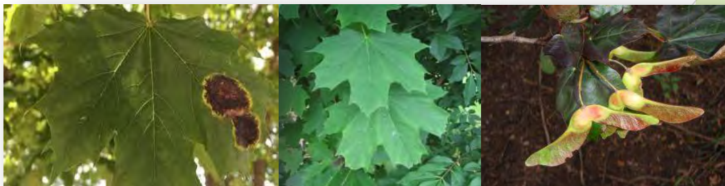
Norway maple

The Norway maple was introduced to North America as an ornamental tree in the mid 1700's. Because it grows in a wide range of conditions and tolerates road salt, it has been widely planted in cities, from where it has escaped to natural areas. It is tolerant of shade and has a long growing season, out-competing native trees and so has become the dominant tree in many parts of our region. It also produces a tremendous amount of seed, which are unpalatable to wildlife. They host the Asian long-horned beetle pest and of course their bitter milky sap makes them useless for producing maple syrup. Many cultivars are sold and it is claimed they are not invasive and produce much less seed. "Crimson King", "Drummondii" (harlequin maple) and "Emerald Queen" are a few examples. While they may produce less seed than the original, it is unlikely that they are beneficial to our native wildlife. This is a small maple and grows to just 12-18 metres. The leaves are dark green & exude a milky sap where the leaf attaches to the twig. Between the lobes (generally 5) the leaf margins are smooth. Late in the season, the well named "black spot" appears on the leaves. While unsightly, there is no useful treatment and it doesn't seem to harm this naturally short-lived tree.