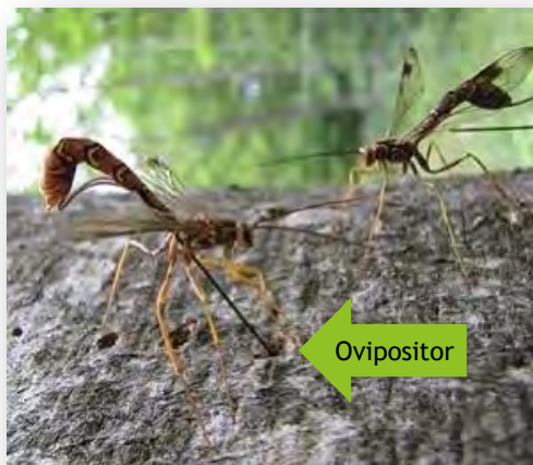
Megarhyssa macrurus female, common name giant ichneumon wasp or stump stabber, with its large ovipositor which it uses to deposit an egg into a tunnel bored by its host.

They lay their eggs on or in the bodies of other arthropods, sooner or later causing the death of their hosts. They mainly follow one of two major strategies of parasitism: either they are endoparasitic (developing inside the host) and koinobiont (allowing the host to feed, develop and moult while they are feeding on it); or they are ectoparasitic, (developing outside the host) and idiobiont (paralyzing the host immediately and preventing its further development). Many parasitic wasps use only larvae as hosts, other groups parasitize different host life stages.