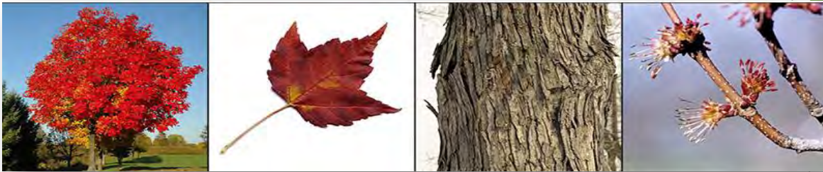
Red maple images from Ontario Tree Atlas

The red maple is a medium sized tree and can grow up to 25 meters tall with its trunk 60 cm in diameter. The leaves are 5-15 cm long, light green on top, paler underneath and turn very red in autumn, hence its name. It is important to not to confuse this native tree with the commonly seen red-leaved maple trees which are a variety of Norway maple - "Crimson King" - more on that later. The bark is smooth and light grey, turning greyish brown, scaly & with ridges as the tree ages. The red maple can tolerate some shade, and different moisture levels but does best in moist soil and sun. In the open, the main stem tends to divide several times leaving it susceptible to breaking so maintenance is needed to keep its form strong.