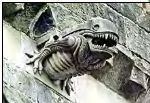
1990 gargoyle at Paisley Abbey, Scotland, resembling the Xenomorph in Alien.

The cruel lifecycle of parasitoids horrified the naturalist Charles Darwin, who wrote in a letter to a colleague in 1860: "I cannot persuade myself that a beneficent and omnipotent God would have designedly created parasitic wasps with the express intention of their feeding within the living bodies of Caterpillars." Parasitoids have inspired science fiction authors and screenwriters to create alien parasitic species that feed on humans. Note the Ridley Scott film "Alien", the first in a series, which appeared in 1979. I will never forget the image of the creature bursting forth from the chest of actor John Hurt.