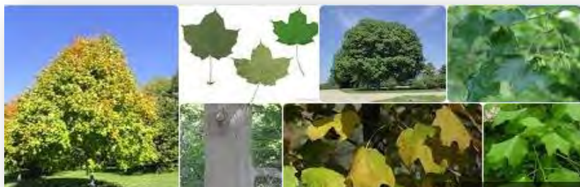
Black maple images from University of Guelph Arboretum

The black maple is a less common variation, or subspecies, of sugar maple which may have better tolerance for heat and drought. Some consider it a separate species. These trees are distinguished from sugar maple proper by the leaves which droop at the sides and are downy on the undersurfaces. Their autumn colour is almost as attractive as well. The bark is darker, almost black, hence its name. This is an increasingly popular street tree in our region.