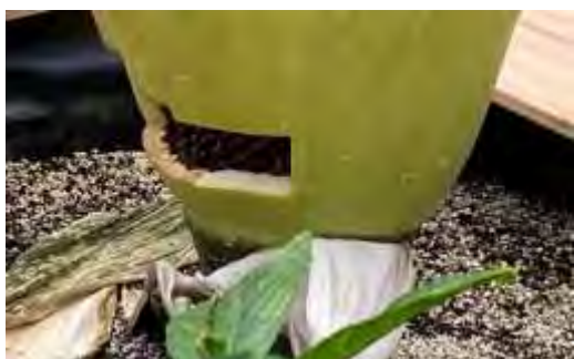
A greenhouse employee had cut open Kramer in order to extract pollen

The spadix produces its own heat to help spread the smell – rising from about 25°C to 35.6°C. The smell then generally dissipates within 24 – 36 hours. There