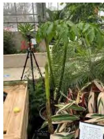
Young Titans – note the speckled petioles

petiole. The leaves can grow to about 15' tall.