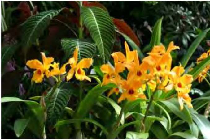
Newsletter of the Master Gardeners of Ontario