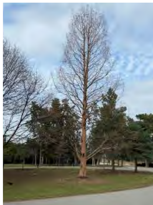
Rediscovered in China in 1944, Dawn Redwood (Metasequoia glyptostroboides), a deciduous conifer, is now grown in parks and gardens all over the world