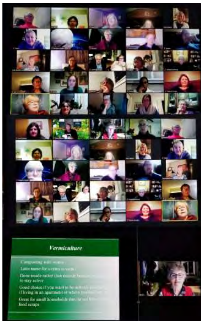
Peterborough MGs Screenshot Photo Courtesy of Emma Murphy

Unfortunately with the current situation we cannot plan anything social too much in advance, but are working hard to be innovative in the way we do things. Thanks to the other Master Gardener groups for all the great ideas and inspiration.