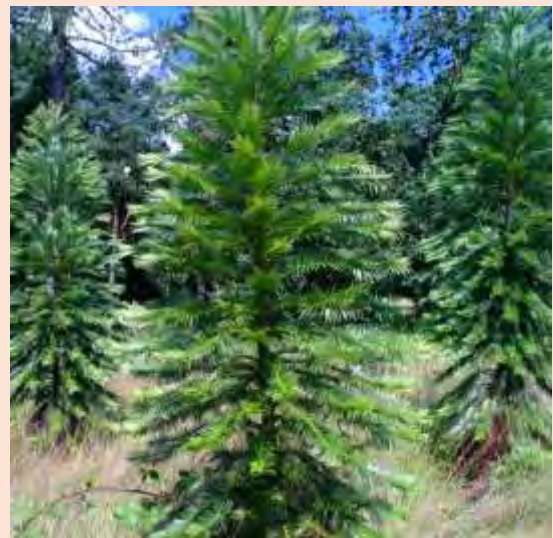
Wollemi pine ( Wollemia nobilis ) http://www.video4art.org/eden/?art=wollemi-pine

Just 80 trees but a wealth of knowledge. I highly recommend this book.