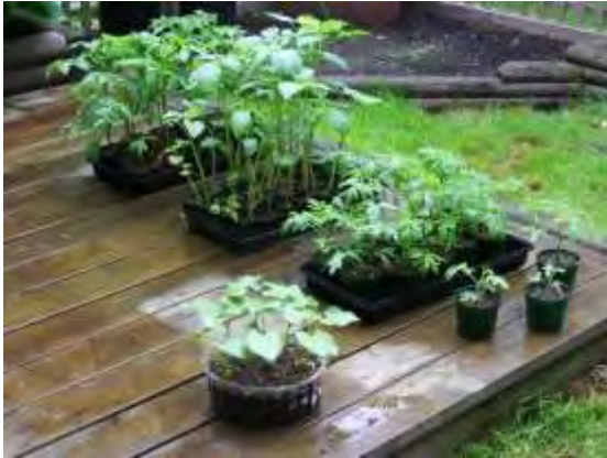
Hardening Off Seedlings

Prior to the presentation the first 40 families that signed up were given a kit with soil, seeds and a Jiffy peat pellet greenhouse system to get them started.