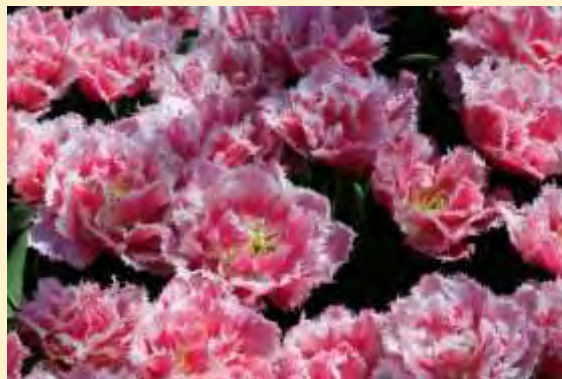
Double Tulips/fringed edges

https://smejoinup.com/5-google-webmaster-tools-alternatives/