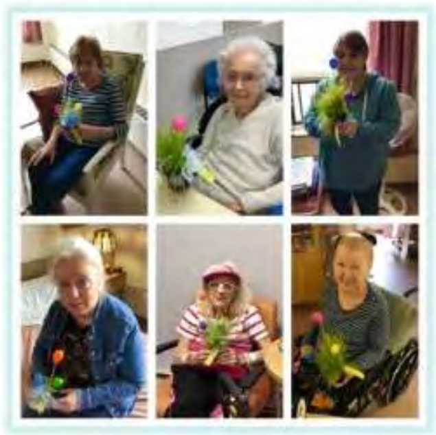
Residents of Bethammi Long-term Care Home who proudly wanted to show off and celebrate their completed horticultural therapy projects