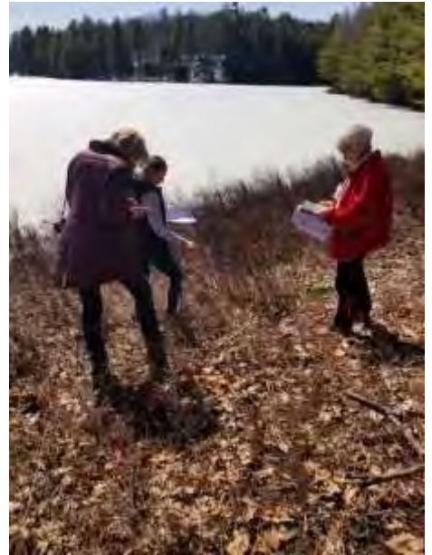
“Here we are pondering over an unknown shrub growing with Myrica gale at the water’s edge”

Tracy brought an ID key from the Guelph Arboretum course to help differentiate the trees and shrubs we saw along the way. It was certainly great to get together outdoors after the long winter.