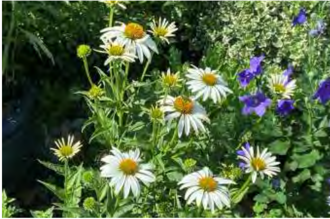
Newsletter of the Master Gardeners of Ontario