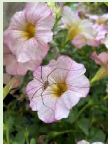
Daddy long-legs spider on Petunia