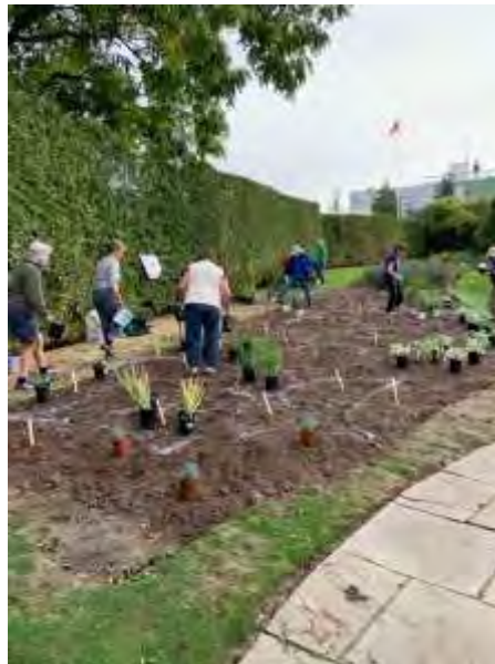
September 2020: The volunteers from the Durham Master Gardeners and Oshawa Garden Club planting the perennials

Durham Master Gardeners are playing a key role in this project through plant identification, pest identification and management, designing and selecting the plants for the new plantings, and guiding the digging and planting activities.