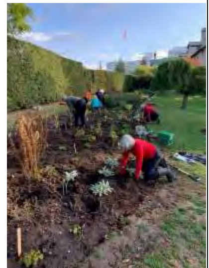
October 2020: Planting the bulbs

Despite the pandemic, we have been able to continue to make progress in the rejuvenation of the gardens and to meet our timelines and budget targets for the project. The planting of the second half of the first border was completed in the fall of 2020 with a dedicated team of volunteers who planted 1250 bulbs and 170 perennials.