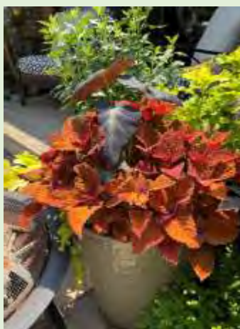
Coleus scutellarioides with Elephant Ears (Colocasia esculenta 'Illustris') in the middle of the pot