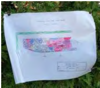
September 2020: The design