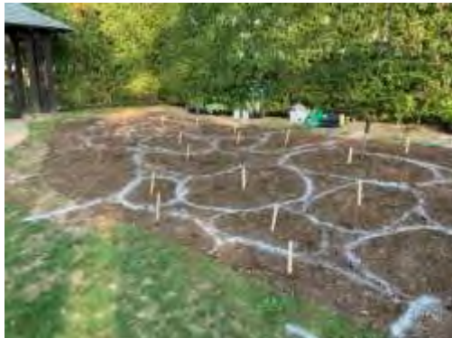
September 2020: The planting areas outlined with white marker paint

While there are no remaining plans or plant lists of the original borders, one of the objectives of the project team is to recreate them in the style of the grand English country house perennial borders inspired by the renowned British garden designer, Gertrude Jekyll. The borders are each approximately 150' long and 12'-14' wide. We created a 5-year project plan which allowed us to divide each border into manageable amounts of work. Each year we will focus on half of one of the borders and in the final year we will evaluate the plantings and help to create an ongoing maintenance plan for the team of volunteers who will look after the borders.