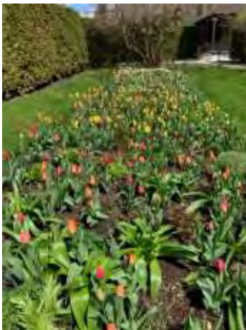
April 2021: The bulbs in bloom

The spring display in the gardens was amazing although with the ongoing lockdown only the Parkwood maintenance staff got the opportunity to enjoy it. But next year's display of bulbs and perennials we hope will be even better with the completion of the next phase. Regular visitors to the garden have already commented on the amazing transformation that has taken place.