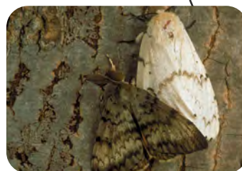
July – August Adult Moths