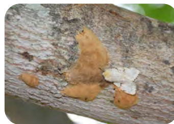
July – April Eggs

Adult males: Greyish-brown with dark markings and can fly and survive about one week, mating with several different females.