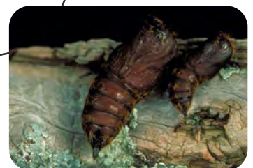
June – July Pupae