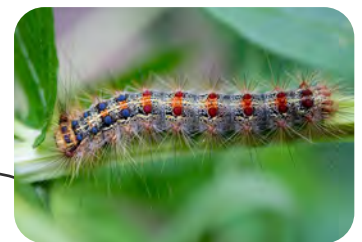
April – June Larvae (Caterpillars)