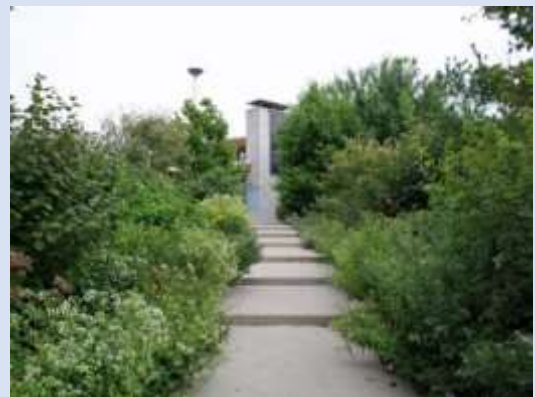
Constructed in 2014, Corktown Common in Toronto incorporates native species and organic practices throughout the park. https://organiclandcare.ca/Corktown