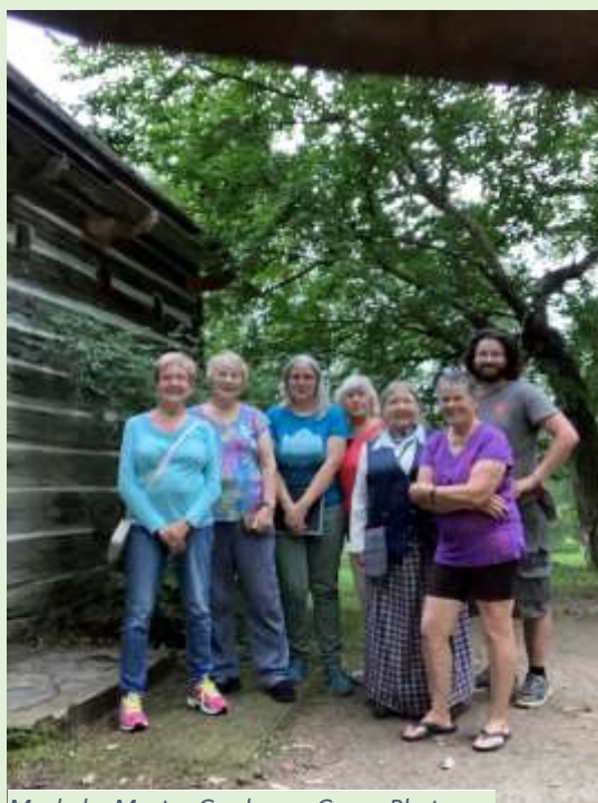
Muskoka Master Gardeners Group Photo