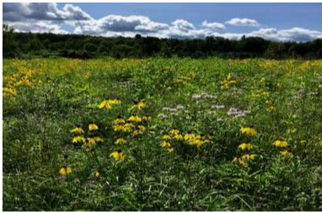
The wildflower meadow at the Inglis Falls Arboretum

The Arboretum consists of a 5 acre collection of trees from around the world and a more recent addition, a 1.4 km trail that leads through 21 acres of woody plants native to Grey Bruce. We had beautiful weather, sunny and cool, for our walk and the picnic that followed. Next year's "self-indulgence day" will have to be good to top this one!