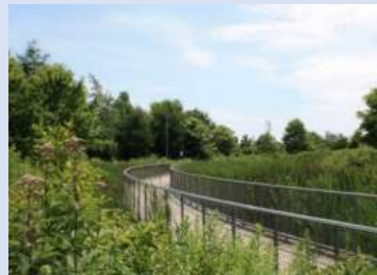
The Corktown Common wetland provides wildlife habitat, flood mitigation for the surrounding community and filters the water from the park's splashpad.