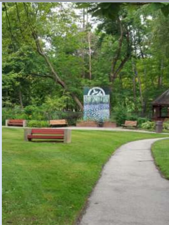
The grounds at Sunnybrook Health Sciences centre in Toronto have been maintained with organic practices, including on-site composting, since 2005. https://organiclandcare.ca/Sunnybrook