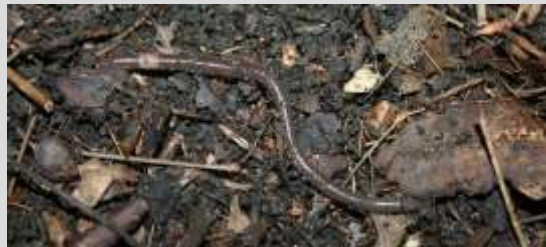
Jumping worm.

Jumping Worms: The Upcoming Environmental Disaster – Laidback Gardener