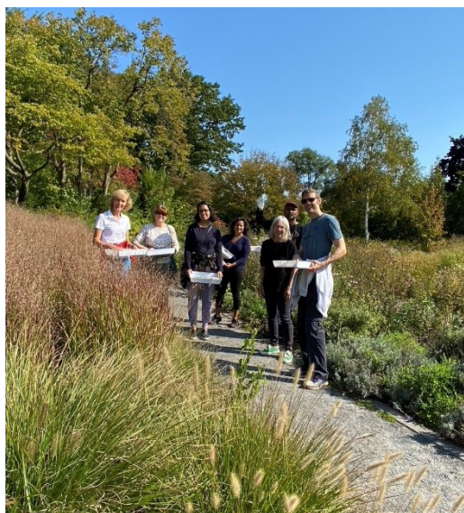
Seed Collecting at Hancock Woodlands Park

We spent an hour at the site collecting the seeds, putting them in small packets and labelling them. All along Jeanne was sharing her knowledge and experiences regarding native flowering plants and it was time well spent on a sunny fall morning.