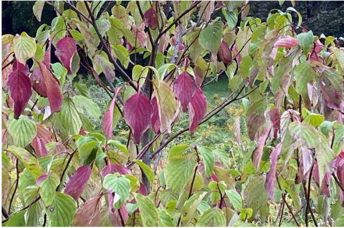
Newsletter of the Master Gardeners of Ontario