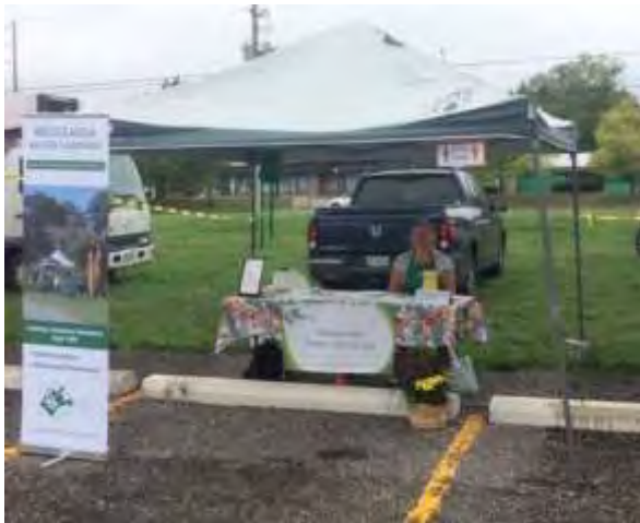
Mississauga Master Gardeners at the Farmers Market – Diana Westland, MGIT

We had a good number of people stop by to ask us their gardening questions, show us photos of their gardens and sometimes just to talk. It was a very successful day and we look forward to returning to the Lakeview Farmers' Market again next year.