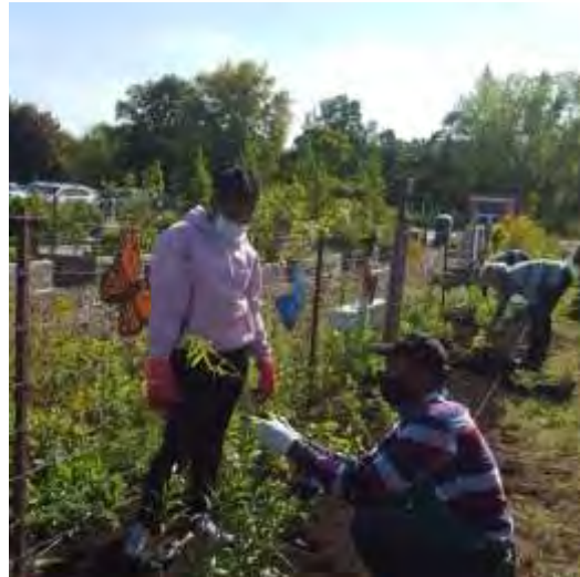
MMGs at the Pollination Planting by CreativeHub 1352

It was a great group representing people of different age groups with various levels of experience.