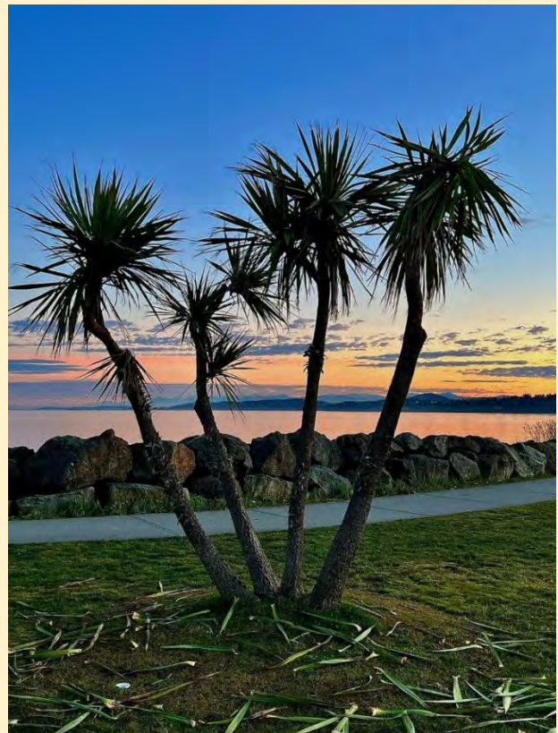
Sidney by the Sea, BC, February 7, 2022