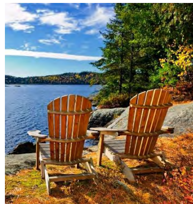
From the homepage of our website - the quintessential character of our northern region