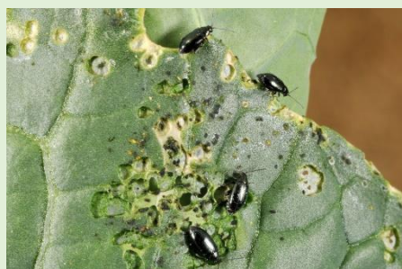
Infamous flea beetles hard at work https://extension.entm.purdue.edu/publications/E-74/E-74.html (Photo Credit: John Obermeyer)

Nematodes needle plants (how nematodes get their food by piercing plants)