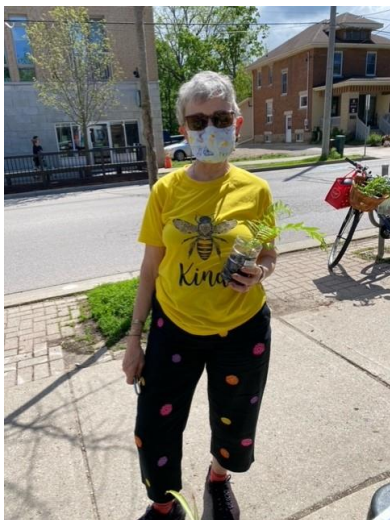
A Satisfied Customer

Various library locations across the London area held plant exchanges and LMMGs were there to answer questions, and to educate the public on invasive species such as jumping worms and periwinkle, to name a few.