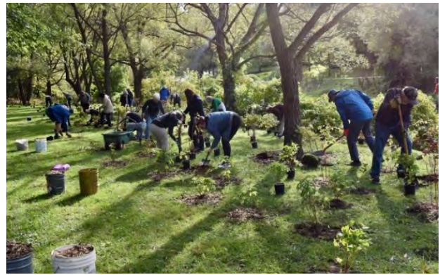
Volunteers planting trees on the banks of the Avon River in Stratford

Sugar maples are native to Canada and provide benefits to wildlife in addition to benefits for people – the Nature Conservancy Canada says buds and twigs are a food source for several mammal and bird species, and a number of butterfly species consume their sap. They also provide shelter for many bird, mammal and insect species. The leaves of the sugar maple provide habitat for around 300 moth and butterfly species.