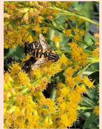
Syrphid fly on goldenrod

Creating new connections with others is always one of the best reasons for volunteering – I look forward to connecting with many of you as I take on the secretary role and will be here to help you out in any way I can.