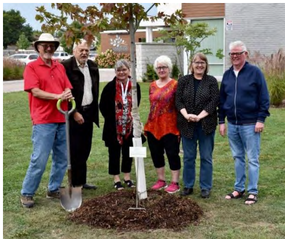
Planting a Sugar Maple at the Rotary Hospice of Stratford Perth

Details: To mark National Tree Day on September 21, Stratford and Area Master Gardener's ReLeaf Stratford Project planted a large native sugar maple ( Acer saccharum ) at the Rotary Hospice of Stratford Perth to thank the many health care workers who work tirelessly in our community. We hope staff and families will enjoy this beautiful sugar maple for many years to come. Drummond Brothers Landscaping donated time and assistance in transporting and planting the tree.