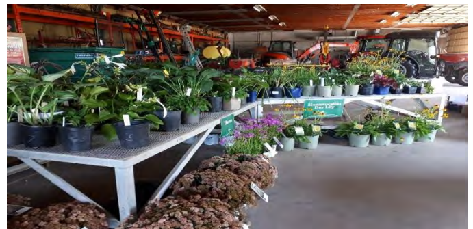
And 2 more of the 8 tables