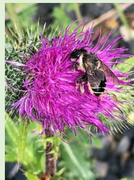
Sleeping bee on field thistle