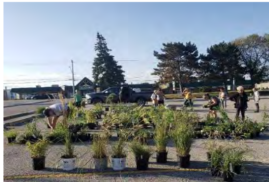
A great selection at this year's Grey County MG Plant sale

Led by force-of-nature MGIT Stephanie Fletcher, it was a busy - and productive - few hours, raising close to $1800 for future projects. It was a great team effort, from planting seeds, dividing and potting up plants, to hauling them into car trunks and backseats. Nice to be back!