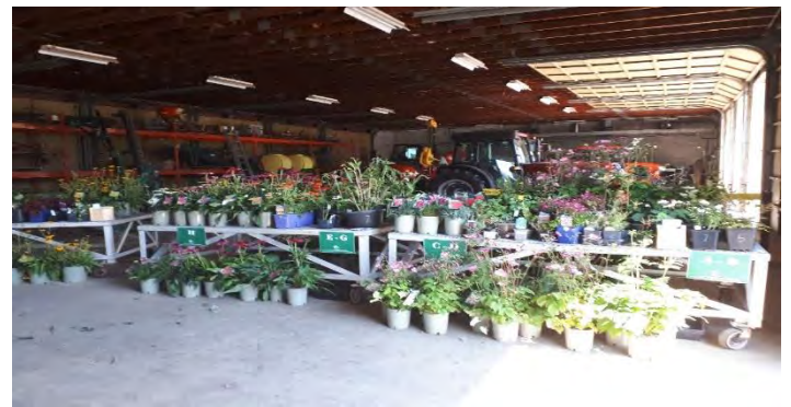
Just 2 ½ of the 8 tables plus approximately 900 sq. feet of floor space of plants

In the Research Centre's Barn, it looked like a botanical garden on Saturday morning at 8AM.