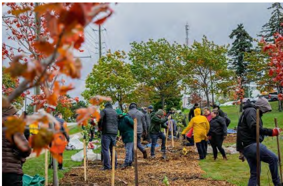
Transforming the lawn of Grey County's administrative building with 20 trees and a lot of muck

Details: On Saturday, October 15, 2022, Grey County MGs took part in the first phase of naturalizing the property of the Grey County Administration building in Owen Sound. The event, called “Transform the Lawn”, was spearheaded by Grey County and the advocacy organization Neighbourwoods North, with help from the tree experts from both the city of Owen Sound and Grey County. Grey County MGs assisted with the design.