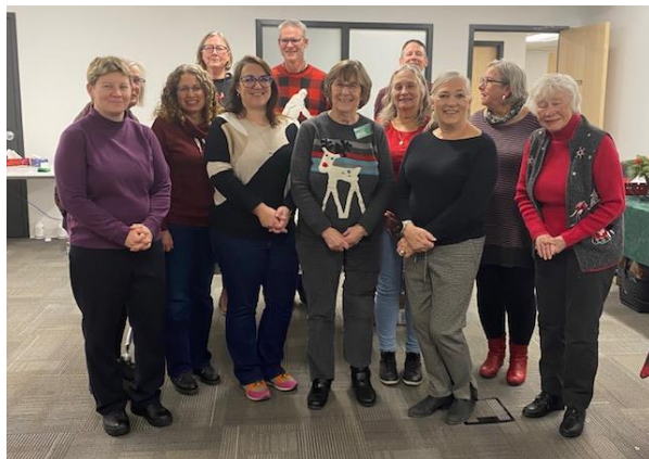
Northumberland MGs group photo

Details: Northumberland Master Gardeners gathered for a Festive potluck on December 14 th 2022 prior to the December meeting. It was a great opportunity to socialize while enjoying a selection of appetizers, beverages and desserts.