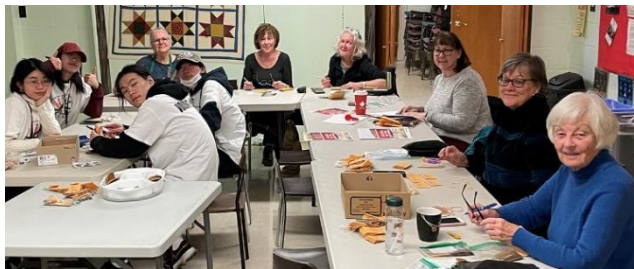
MGs and a group of international students work together to package seeds for our Seedy Sunday event in February.

Details: On Jan. 13 th , Niagara MGs gathered to package seeds for the upcoming Niagara Seedy Sunday in St. Catharines on Feb. 26 (please see the Upcoming Events section for more info!). Helping Niagara MGs members were a group of international students who were an enormous help.