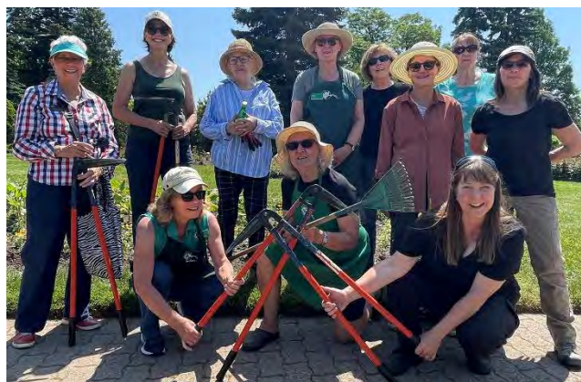
Niagara MGs brandishing some tools of the trade at the Niagara Botanical Gardens rose garden in May

Details: The Niagara group spent a lovely morning in late May volunteering at the Niagara Botanical Gardens (NBG). The jobs involved helping edge the beds in the rose garden and planting pachysandra in another part of the NBG.