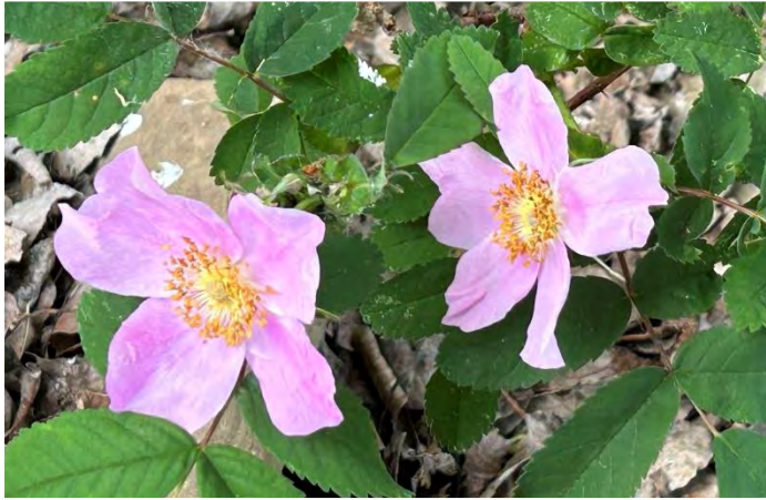
Newsletter of the Master Gardeners of Ontario