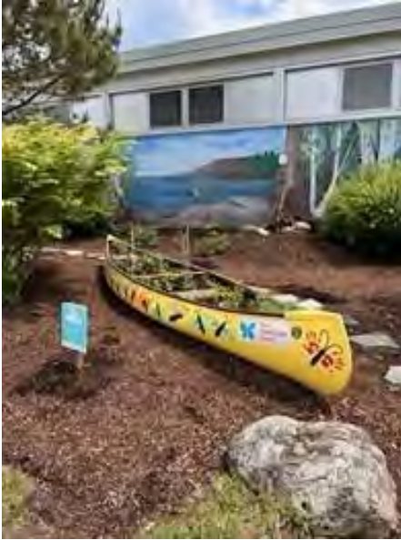
Butterfly pollinator garden at Beaver Valley Community School