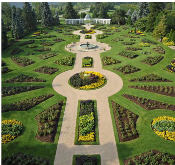
An image of the rose garden from the Niagara Parks website. The rose garden boasts over 2,400 roses and is one of North America's largest Victorian rose gardens.