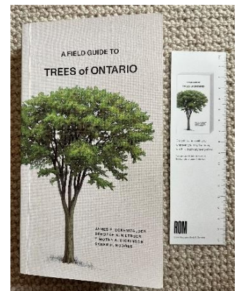
A new must-have: The ROM's Field Guide to Trees of Ontario