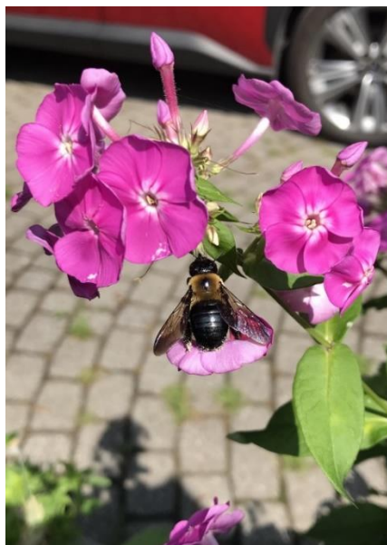
Carpenter bee on Phlox paniculata