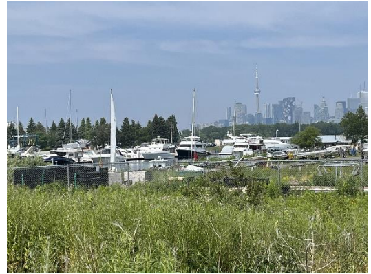
The Toronto skyline from Tommy Thompson Park