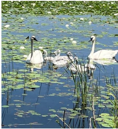
Swans and their cygnets, Tommy Thompson Park

Details: The weather was lovely on June 24 as a group of TMGs (and some partners) met for a guided tour of Tommy Thompson Park (aka the Leslie Street Spit). Our