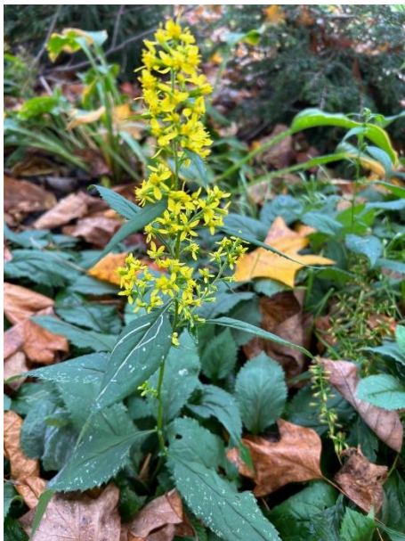
Solidago flexicaulis (zigzag goldenrod)