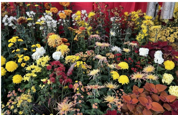
Newsletter of the Master Gardeners of Ontario