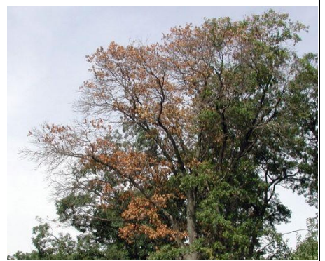
Oak wilt disease in an oak tree.

This disease can cause serious damage to Canada's oak tree population. There are several pathways by which oak wilt can spread, including: