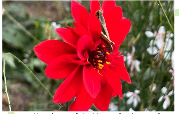
Newsletter of the Master Gardeners of Ontario