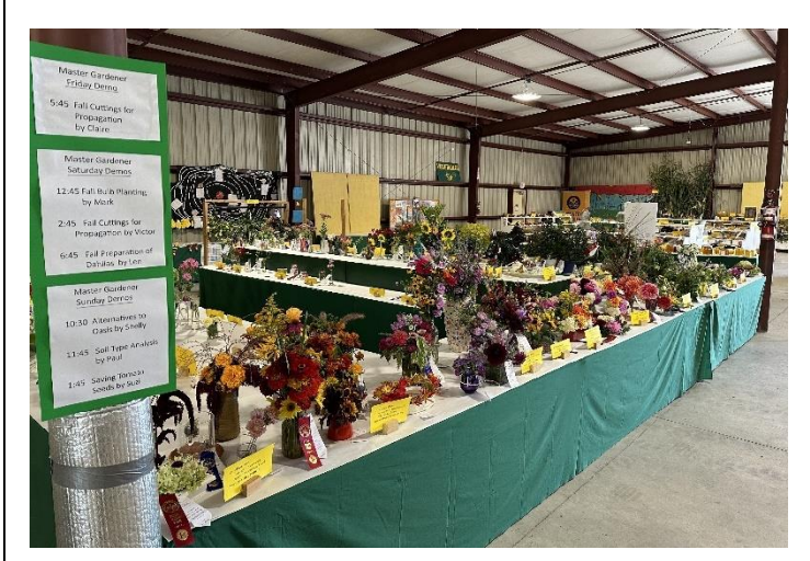
The Flower Show at the Port Hope Fair, including a poster of our demos

They were viewed by many, often generating gardening questions which were then answered on the spot by our advice clinic staffed by Northumberland Master Gardeners for all the hours that the building was open.