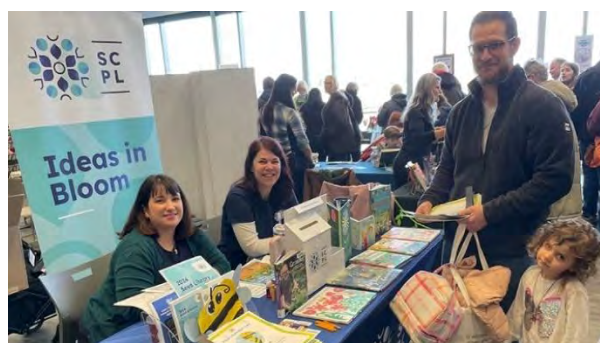
The St. Catharines' Public Library brought lots of information and suggestions for books on gardening