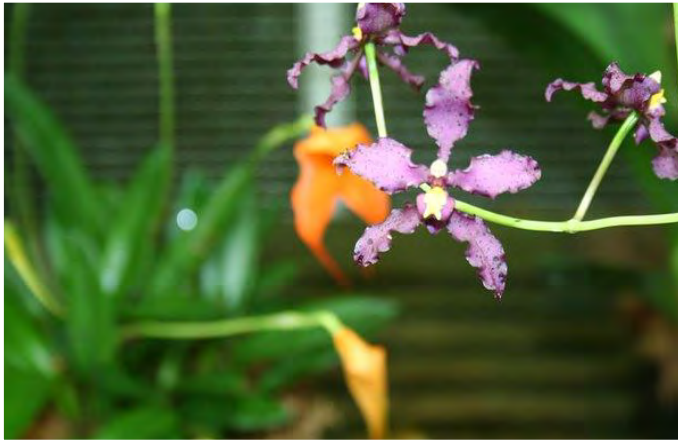
Newsletter of the Master Gardeners of Ontario