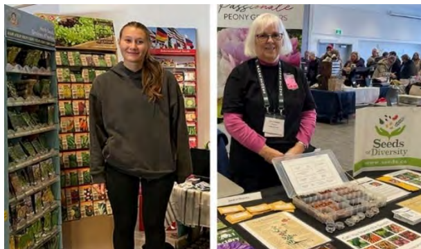
Vendors included Rice Road Nursery and Seeds of Diversity (which facilitate seed exchange events across Canada)