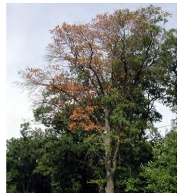
Oak wilt disease in an oak tree. Photo credit: Joseph O'Brien, USDA Forest Service, Bugwood.org https://www.canr.msu.edu/news/oak_wilt_diagnostics_and_prevention