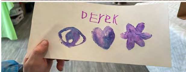
Kids Activity Area crafts included 'egg heads' and potato prints, as well as seed planting and garden journals