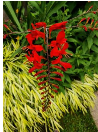
Hakonechloa macra 'Aureloa'

This is Ipomopsis rubra (standing cypress), native to south of the Great Lakes and a gift from MG Bev Wagar. The only time we see hummingbirds is when this is in bloom.