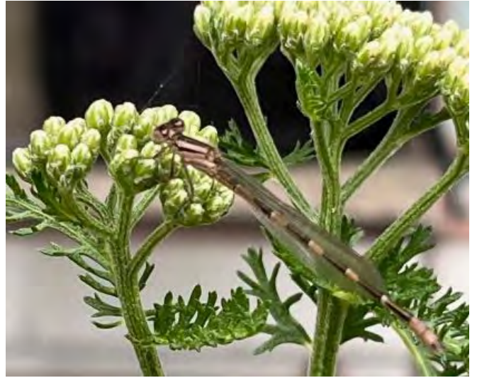
Enallagma carunculatum (Tule Bluet – a species of damselfly) on Achillea millefolium