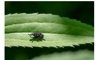
early stage nymph

Also check for spotted lanternfly (SLF). Canada is preparing for the potential arrival of the SLF, present in the United States and getting closer to the Canadian border. The spotted lanternfly would be devastating for Canada's wine, fruit, nursery and forest industries.