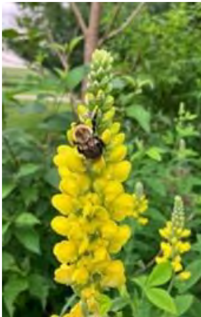
Carolina lupine ( Thermopsis villosa ) by Margaret Stewart

Beautiful pictures from 1000 Islands MGs, some with interesting insects!