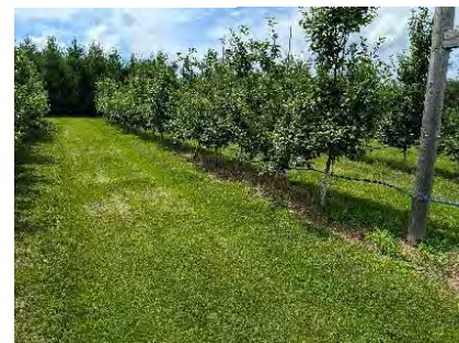
Trellised Apple Orchard

The couple attend the local farmers' markets and the natural food store to sell their berries, lavender and cut flower bouquets. The gardens are beautifully kept, and it is a pleasure to visit them.