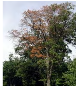
Oak wilt disease in an oak tree. Photo credit: Joseph O'Brien, USDA Forest Service, Bugwood.org https://www.canr.msu.edu/news/oak_wilt_diagnosing_and_preventing

How You Can Help: As a leading voice in the field of tree and plant health, the CFIA would like Master Gardeners to share this message with the public, our clients, and staff.