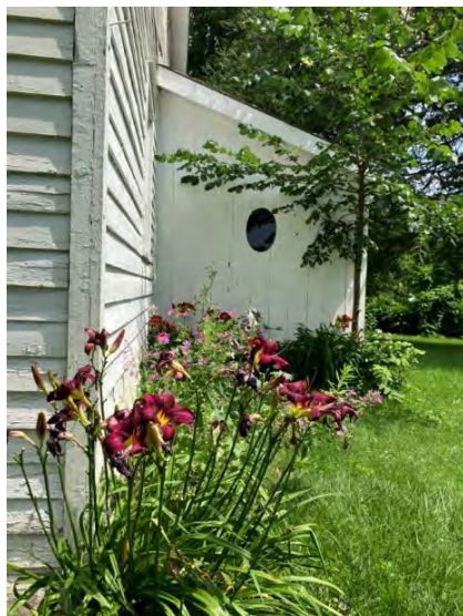
Echinacea and other native plants in behind the daylilies

It felt so fabulous and rewarding to see the enthusiasm of participants. Many said they did not realize how beautiful these plants were".