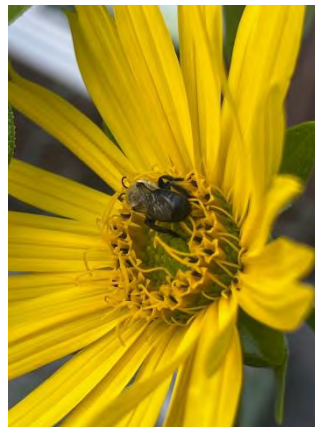
Eastern thistle longhorn bee ( Melissodes desponsus ) on Silphium perfoliatum (cup plant)

The following photos are from MGiT Elsabé Falkson