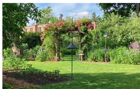
John Cabot roses looking like summer on PEC MG Ren Duinker's beautiful arbour