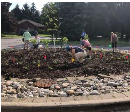
Planting on June 17 th , Stratford General Hospital