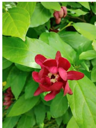
Calycanthus floridus (Carolina allspice)