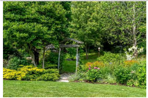
Early June Garden by Lyanne Schlichter