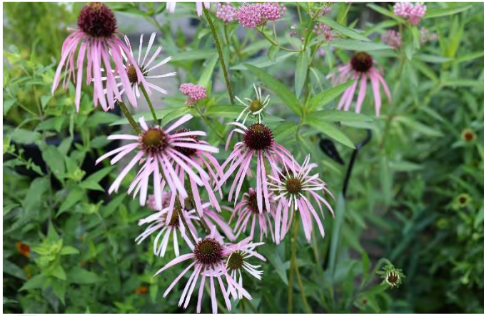
Newsletter of the Master Gardeners of Ontario