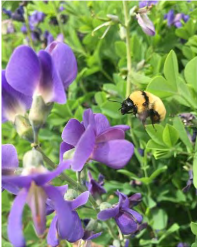
Coming in for a landing on Baptisia