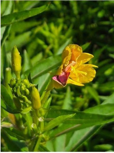
Beautiful Oenothera biennis (common evening primrose) flashing a pink petal.