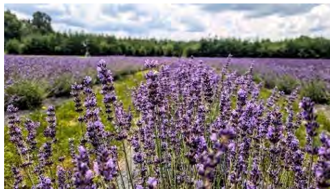
Lavender Field

Details: Unlike other groups, Lanark County Master Gardeners like to visit unique and interesting spots around the county each month. On July 8 th , we visited the Machan Gardens. This garden is owned and operated by a wonderful couple who both have full time, demanding jobs and yet their gardens are very awe inspiring. The highlight on this visit was the Lavender fields, at the peak of their blooming.