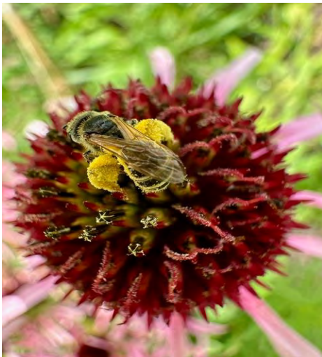
Pollinator visiting her Echinacea.