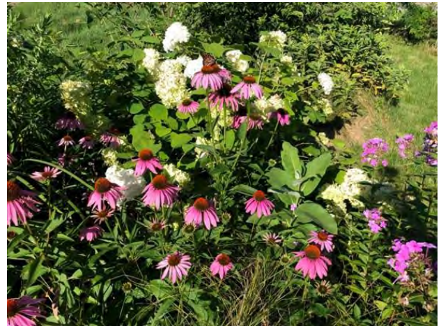
by MGiT Sandra Jass

A Monarch is having a drink on an Echinacea (top flower).