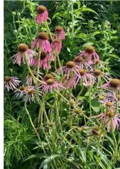
Pale purple coneflower ( Echinacea pallida)