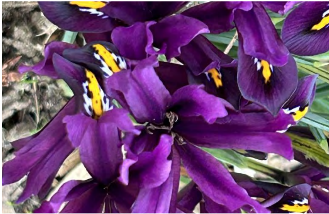
Newsletter of the Master Gardeners of Ontario