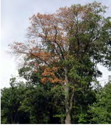
Oak wilt disease in an oak tree. Photo credit: Joseph O'Brien, USDA Forest Service, Bugwood.org https://www.canr.msu.edu/news/oak_wilt_diagnosing_and_preventing