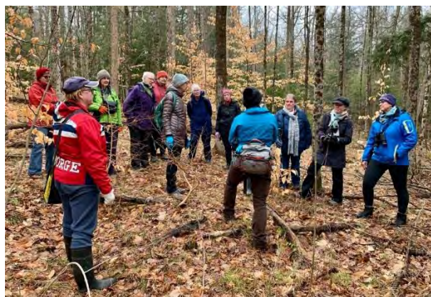
PMGs at M.S. Burnham Provincial Park