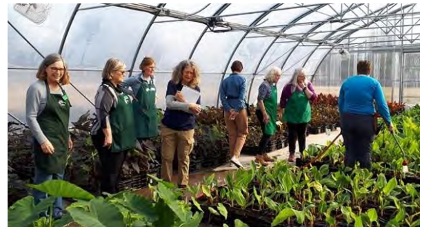
Niagara MGS tour a Niagara Parks greenhouse full of canna lilies and Colocasias destined to be planted in gardens outside

There are solutions, but the current Ontario government spends only $4 million annually to fight invasive species, despite the $3.6 billion economic impact they create (from Auditor General Bonnie Lysyk).