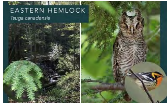
The Eastern Hemlock offers important habitat for many interesting birds such as long-eared owls and Blackburnian warblers, along with bears and other creatures.