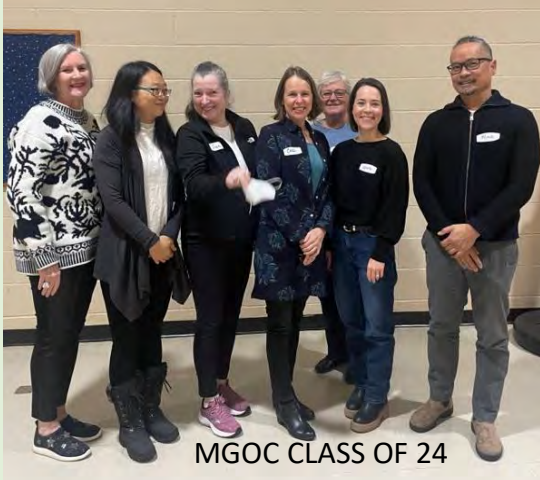
MGOC CLASS OF 24